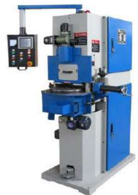
Spring Grinding Machine