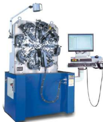
CNC Spring Farming Machine