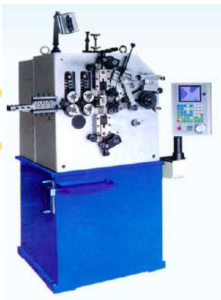
CNC Spring Coiler