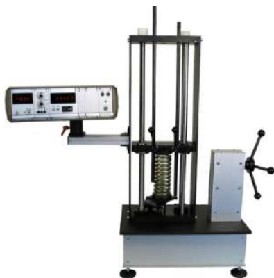
Load Testing Machine